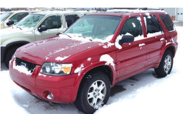
2005 FORD ESCAPE 4WD, leather, sunroof, tow pkg. AS LOW AS $199 A MONTH