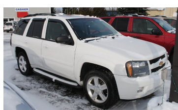
2008 CHEVY TRAILBLAZER LT 4WD, sunroof, tow pkg, leather, loaded. Only 75 K. AS LOW AS $199 A MONTH