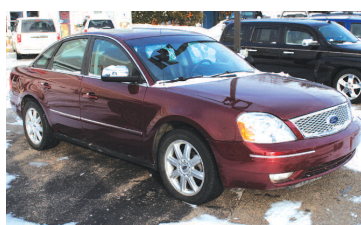
2005 FORD FIVE HUNDRED AWD, leather, sunroof. AS LOW AS $169 A MONTH