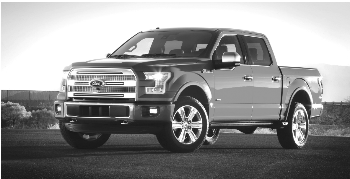
Ford recently introduced the all-new Ford F-150, the reinvention of America's favorite truck. It is the toughest, smartest and most capable F-150 ever – setting the standard for the future of trucks.