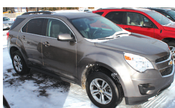
2010 CHEVY EQUINOX LT-2 Only 41 K, 25 MPG, tow pkg. AS LOW AS $219 A MONTH