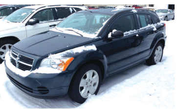
2007 DODGE CALIBER SXT 93 K. Great MPG AS LOW AS $199 A MONTH