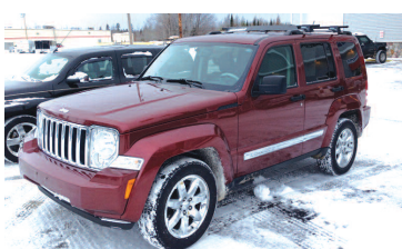
2008 JEEP LIBERTY LIMITED 4x4, leather, sunroof, tow pkg, nice AS LOW AS $199 A MONTH