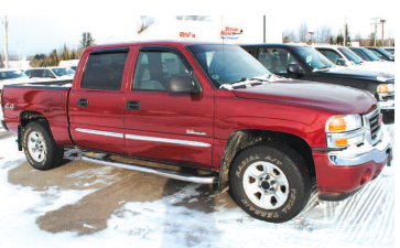
2006 GMC SIERRA 4WD, 4 door, bedliner, tow pkg. AS LOW AS $199 A MONTH