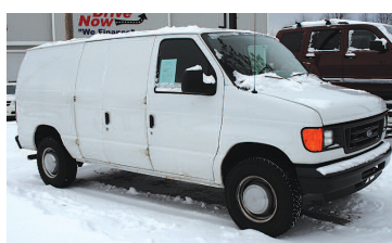
2006 FORD E-250 CARGO VAN Lots of room for work. Air, new rubber. Only 89 K. AS LOW AS $189 A MONTH