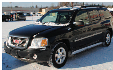
2004 GMC ENVOY XL Leather, 3rd row seat, 4WD, tow pkg, loaded. AS LOW AS $199 A MONTH