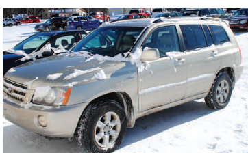
2002 TOYOTA HIGHLANDER. 4x4, 109 K, 3.0L V-6, 4 door, leather. SALE $10,995. AS LOW AS $249 A MONTH.