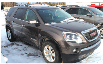
2008 GMC ACADIA SLT-1 AWD, heated, leather seats. AS LOW AS $219 A MONTH