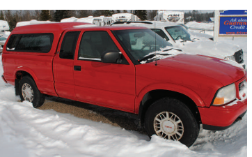
2000 GMC SONOMA SLS Ext cab, tow pkg. AS LOW AS $99 A MONTH