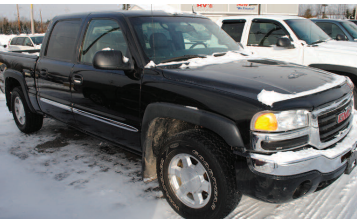
2004 GMC SIERRA SLT Z-71 OFF ROAD 4x4, crew cab, short bed, tow pkg, bedliner, leather. AS LOW AS $199 A MONTH