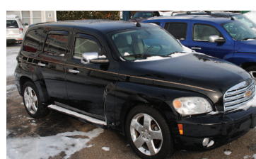
2006 CHEVY HHR Sunroof, leather, very nice. AS LOW AS $179 A MONTH