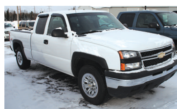
2006 CHEVY SILVERADO 1500 LT3 Ext cab, 4x4, seats 6, bedliner, tow pkg, Pioneer sound. AS LOW AS $199 A MONTH