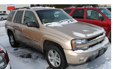
2004 CHEVY TRAILBLAZER LT Leather, 4WD, Pioneer sound, tow pkg. AS LOW AS $159 A MONTH