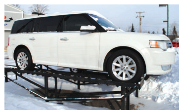
2009 FORD FLEX SEL AWD, good MPG, only 79 K. AS LOW AS $249 A MONTH