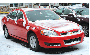
2010 CHEVY IMPALA LT Loaded, 29 MPG, very nice. AS LOW AS $189 A MONTH