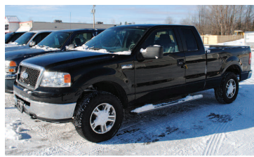
2007 FORD F-150 XLT 4x4, bedliner, tow pkg, seats 5, 5.4 Triton. AS LOW AS $199 A MONTH