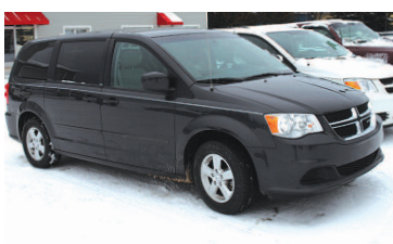
2011 DODGE GRAND CARAVAN Stow-N-Go seating, Very nice van. AS LOW AS $249 A MONTH